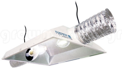
Raptor Reflector AC Dual Lamp