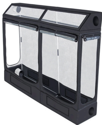
Probox Outdoorpro 240L SLIM 240x60x220cm