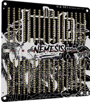
Jungle LED The Jackson 150W NEMESIS