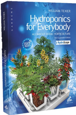
Hydroponics for Everybody New English Edition