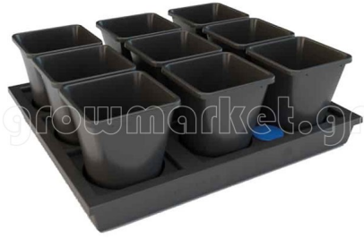
Auto 9 XL System with 25lt Pot