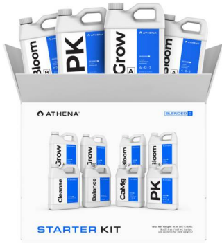
Athena Blended Starter Kit